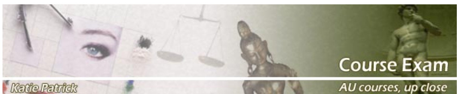
SOCI 378: Media Construction of Social Movements & Issues

If anyone is interested in learning more about the Middle States Commission on Higher Education (MSCHE) and about the other member institutions alongside AU that are part of this membership association, please check out <u>http://www.msche.org</u>. For information on Niagara University's online courses, visit <u>http://www.ed2go.com/niagara</u>.