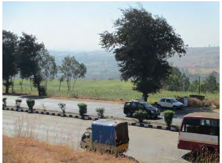
A drive through rural India.

This series has attempted to create an image of the real India, but there's no substitute for an in-person visit. India is truly a fascinating place, with customs and practices so different from our North American norms. If you're seeking a unique adventure, consider travelling to India. You'll never forget your experiences there!