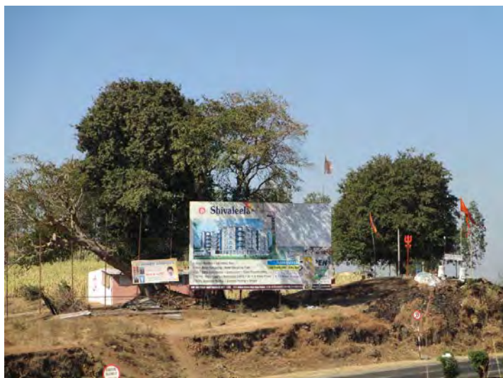
New development outside of Mumbai.

This four-part series chronicles the author's experiences visiting her husband's family in Mumbai, India this past winter. In this final instalment, she talks about some of the interesting occurrences during her last few days there. (To get the rest of the story, read Part I , Part II , and Part III .)