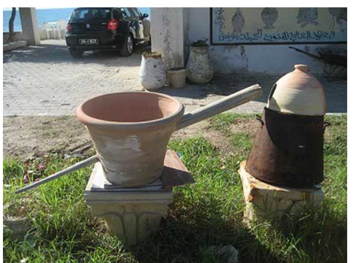
A traditional still used to make flavoured waters from blossoms

When you return home, they'll again ask you how you are. They'll have discussed your problem while you were gone. They may have prayed for you. They'll sprinkle scented water on your head. Someone comes up with another