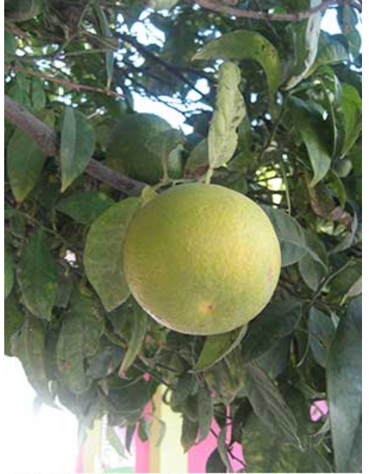
A mock orange. All but inedible, but its tree produces blossoms which are distilled into water used in most homes for flavourings and medicines

The same laboratory has found in the common myrtle (Myrtus communis) a capacity to hunt out and remove free radicals, rendering it a suitable candidate for further research in cancer prevention. In other studies, tree germander (Teucrium ramosissimum) was found to have some effect in treating infectious diseases, which is how it was traditionally used in Tunisia.