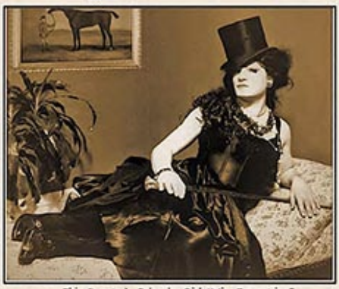
This Quarter's Calendar Girl: "Miss Equestrian" by Engwood Quilby

TICKETS ARE AVAILABLE NOW for The Repository of Wooders. You will want to visit again and again. Saitable for all age groups and every member of the family. Picnic area searby and refreshments available. Do not miss such autounding ites as The Eyes of Descanes' Daugitter, the Borneo Sosie Skeieton, The Cricket Cage of Duom, or The Gift Shoo.