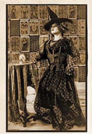
Madam Sosostni, Astrologer, Cartomanco, Milliner

Only you hold the key to what is in your best interest concerning this matter. Move ahead with confidence and you will find the lack that you seek!