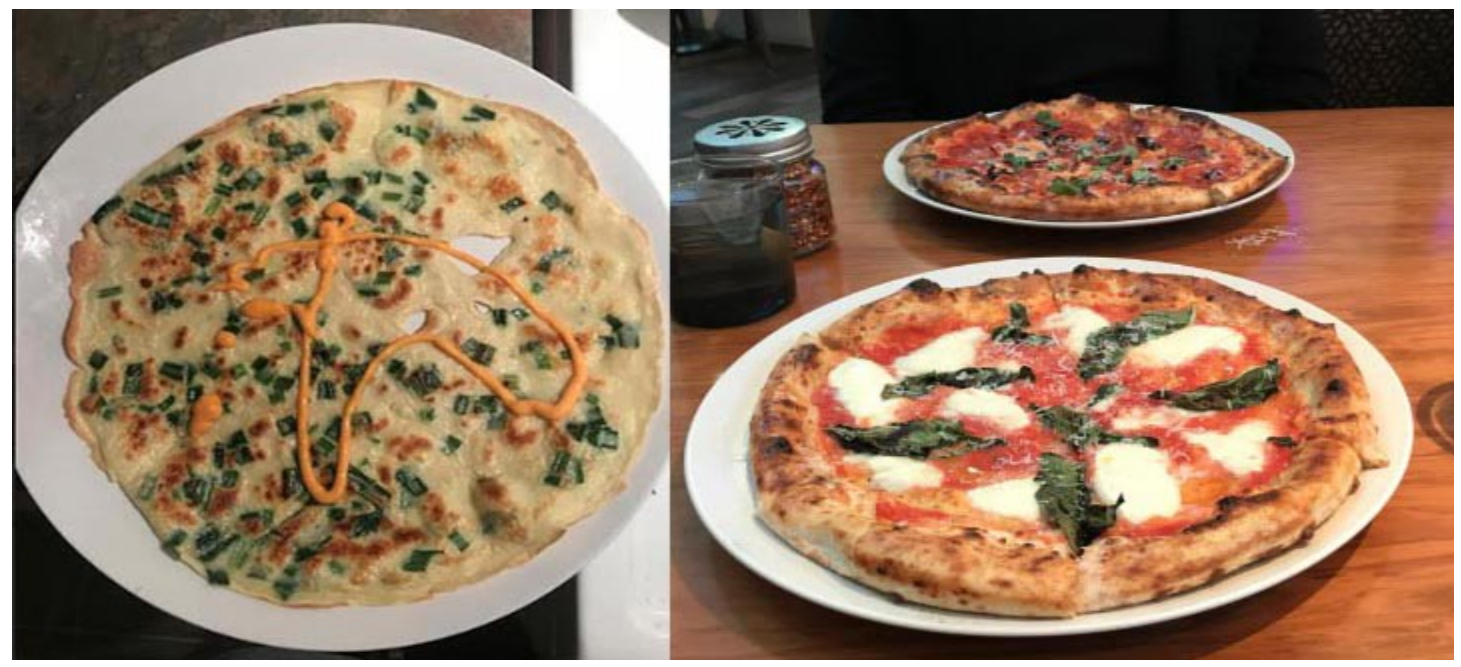
The appearance of these delicious carbs differ drastically, making us wonder how did the first picture transformed into the second picture

Green onion cakes, also known as scallion pancake or "cong you bing" is a traditional street food item originating in Northern China. Unlike the take-out items we find at local Chinese restaurants, the original edition is in fact made from unleavened bread. A well-known rumor in China suggests that pizza was in fact an adaptation of green onion cakes. After Marco Polo's trip to the East, he brought back the scallion pancake with a few modifications that eventually became pizza.