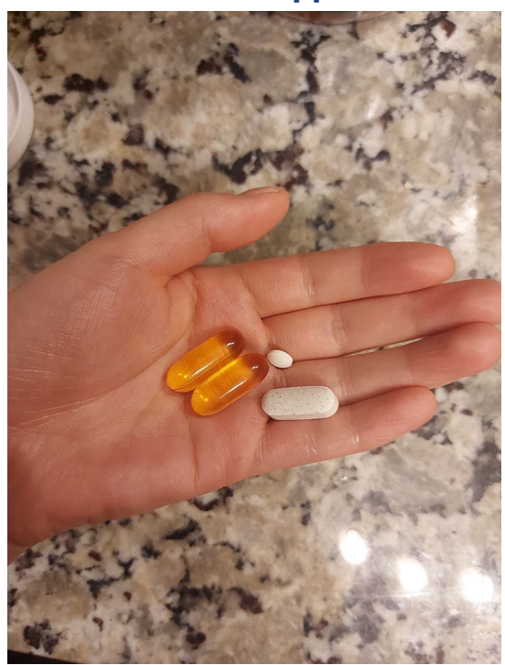
An assortment of vitamins and supplements I take each day.

One of the questions I get a lot as a pharmacist is what vitamins should I take? Do I just take a multivitamin and call it a day, or do I need more than that? Vitamins are essential micronutrients for our bodies. They help protect us from free radical damage, are integral to our metabolism and daily function. And although many of us are not actively taking vitamin supplements, there's a lot of vitamins we derive from food. If you have a balanced diet it could be argued that one does not need vitamins. On the flip side, if you don't have a healthy diet or have certain dietary restrictions, taking vitamins may be an essential addition to your daily routine. So which vitamins do you need and where can you get them from?