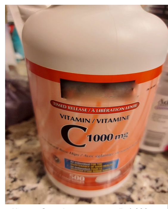
Vitamin C supplements are usually 1,000 mg or 500 mg. It's water soluble, so gets eliminated from the body quickly, meaning taking a higher dose has negligible side effects.

absorbing iron, taking vitamin C supplements may be effective. Vitamin C 500 mg or 1000 mg are both effective at ensuring normal bodily functions.