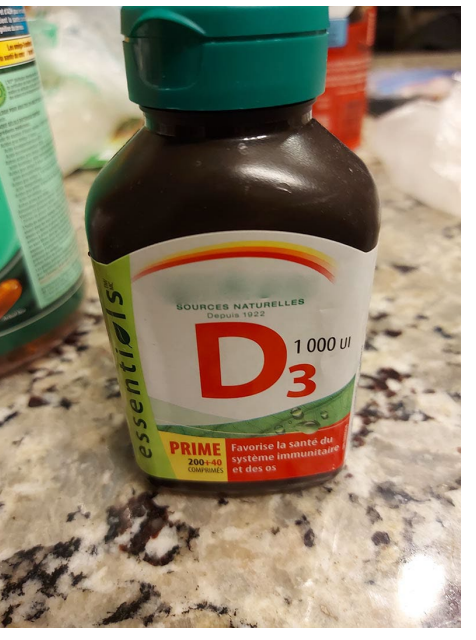
I take a stronger Vitamin D supplement. Typically, higher doses are only recommended for older individuals (50+ years old).

This is another common vitamin that is recommended for adults over age 50. Especially women, as our bone densities are typically lower than that of men. Vitamin D is the vitamin responsible for absorption of calcium. Deficiency of vitamin D in childhood causes rickets, a condition where bones are soft and malformed. Vitamin D deficiency in the winter has also been associated with seasonal affective disorder (SAD). The recommended vitamin D3 amount per day is 600 IU for adults. In those with osteoporosis and other bone related problems, higher doses may be recommended.