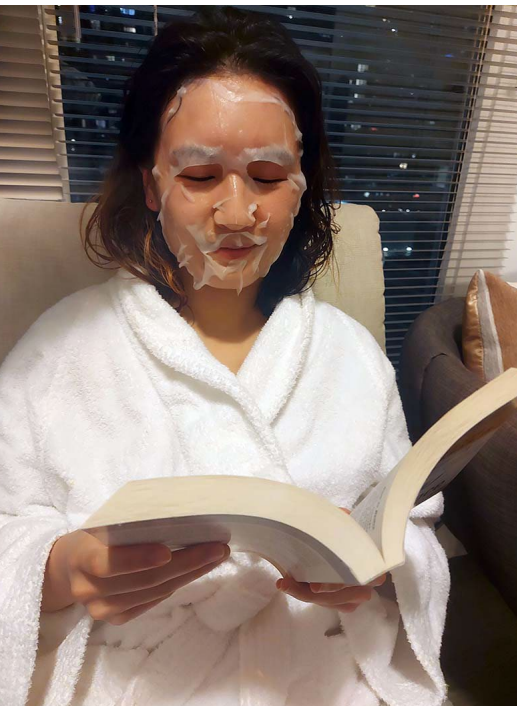
My bedtime routine includes some light reading and a facial mask.

Having overcome my bad habit of popping pimples as a teenager, I can safely say that there are several skin infections and problems that can result from improper skin care. For example, not wearing adequate