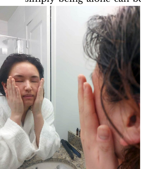
Having lived in Alberta for most of my life, using a good moisturizer is key to protecting my skin against eczema flareups.

For some, skincare routines each evening can take anywhere between 5-20 minutes. For those who spend longer on their skin, usually they are in their bathroom, in a quiet setting where they are in front of the mirror observing their skin. The process of simply being alone can be meditative. You're not distracted by