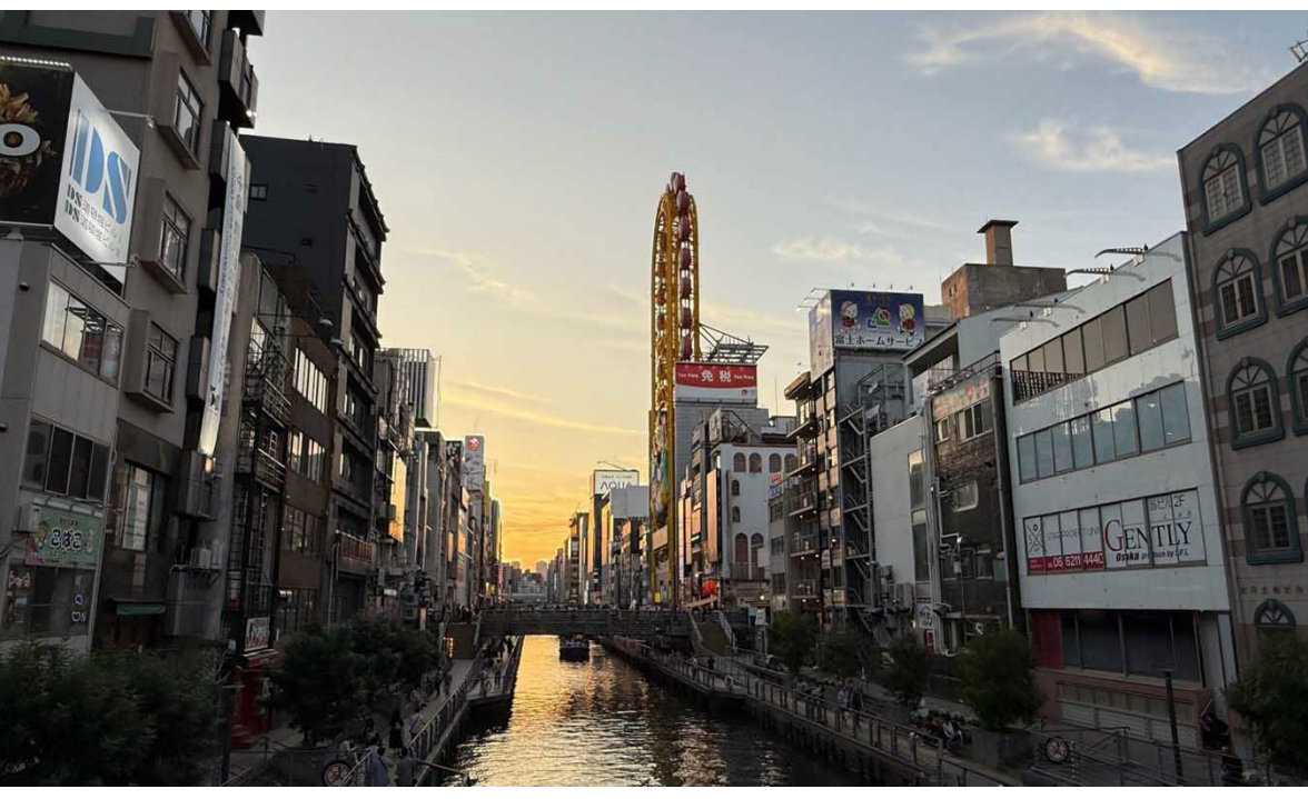
Dotonbori in Osaka, Japan

For those of you in Alberta, you can take a direct flight from Calgary to Tokyo. Round-trip prices