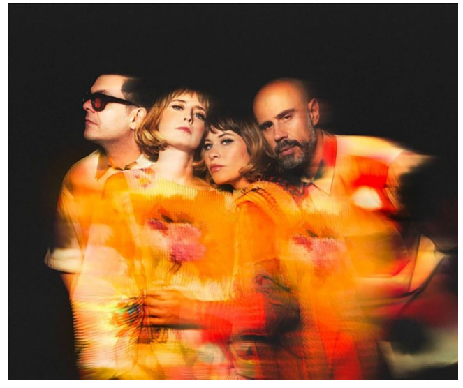
An Image of Lucius Via Fantasy Records