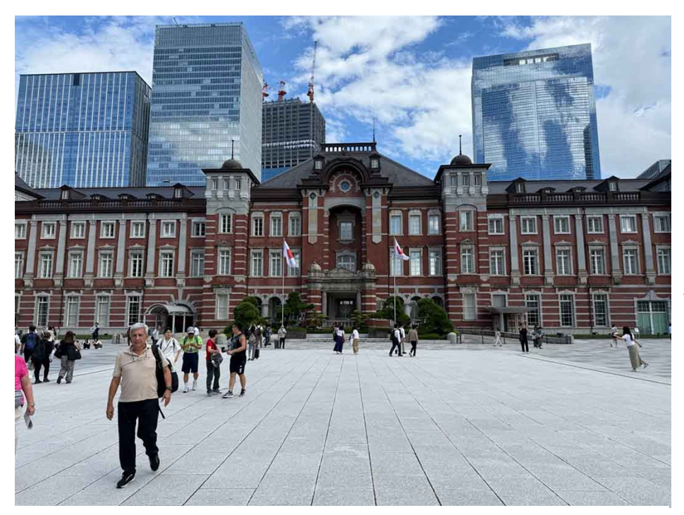
Tokyo Station in Tokyo, Japan