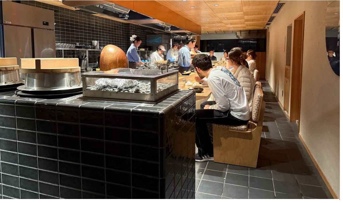
Omakase restaurant in Kyoto, Japan